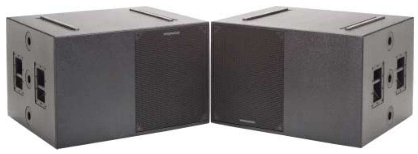
Two Model 118 Road Version Subwoofers in a SCHOLAR Configuration

Contents subject to change without notice. Dimensions provided for general reference only.